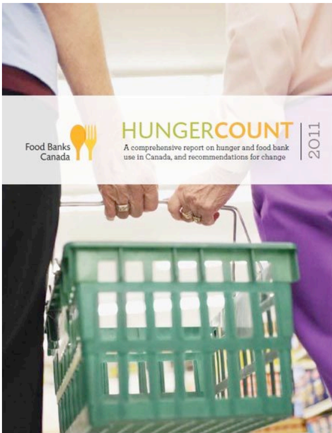
A summary of findings from Food Banks Canada's HungerCount 2011 report